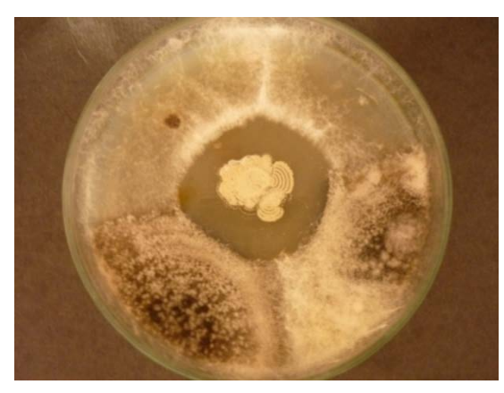
Fig. 1: Antifungal activity of actinobacteria ACT7

The enzymatic activity of Streptomyces sp. ACT7 revealed that this isolate could effectively suppress the radial growth of phytopathogens viz. Fusarium oxysporum and Alternaria sp. The maximal growth inhibition was observed on the 9th day. The isolate Streptomyces sp. ACT7 showed highest inhibitory activity (11.33±0.47 mm) against Alternaria sp. than against F. oxysporum (10.66±0.94 mm) (fig. 1). Previous studies reported that the fungus showed different responses to chitinase from S. griseus [21]. The present study suggested that the protein composition in the cell walls of different pathogenic fungi might make some fungal cell walls more resistant to chitinolytic degradation. Thus, only the coculture containing F. oxysporum with Streptomyces sp. ACT7 and Alternaria sp. with Streptomyces sp. ACT7 was selected for SEM analysis. The scanning electron microscopic study showed that there were breakage of the cell walls of F. oxysporum and Alternaria sp. mycelia when acted upon by Streptomyces sp. ACT7 (fig. 2). The previous findings suggested that the extra-cellular secondary metabolites and hydrolytic enzymes, including chitinase play a crucial role in fungal growth inhibition.