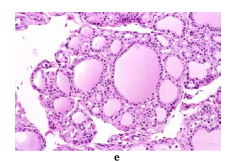
Fig. 1: Histopathology of thyroid glands in different groups a) Normal Control rat b) Hyperthyroid induced rat c) Hyperthyroid induced rat treated with FRBE 250mg/kg e) Hyperthyroid induced rat treated with FRBE 350mg/kg f) Hyperthyroid induced rat treated with FRBE 450mg/kg