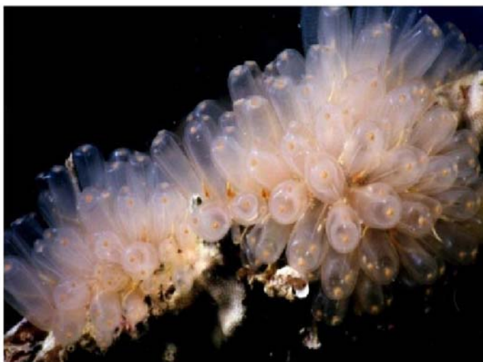
Fig. 1: Ecteinascidia turbinata, the sea squirt, growing in its natural habitat

Trabectedin Ecteinascidin-743 (Ecteinascidin-743, Yondelis™, Pharma Mar/Johnson & Johnson) is a tetrahydroisoquinoline alkaloid derived from a Caribbean tunicate Ecteinascidia turbinata 1 . ET-743 is a chemotherapeutic agent (Alkylating drugs ) that bind to DNA and disrupt its function. It has shown in vivo activity in nude mice harbouring human resistant xenografted tumors 2 . (Figures 1 and 2).