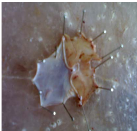
Fig. 3: Methanol extract treated