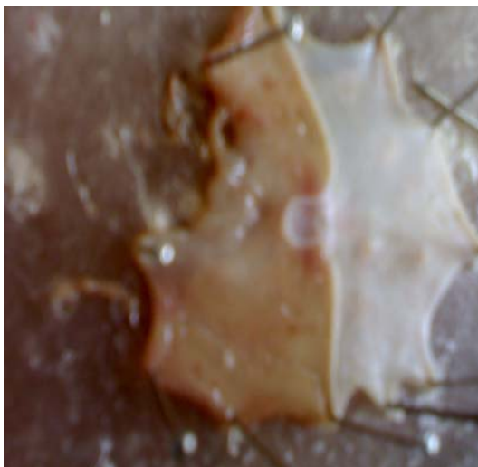
Fig. 4: Cimetidine treated group