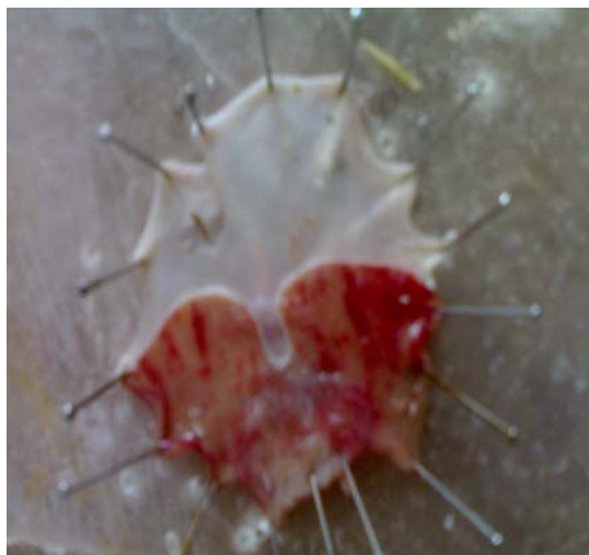
Fig. 1: Control group