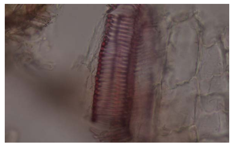
Fig. 5: Powder microscopy of P. hadiensis (phloroglucinol) (40x)