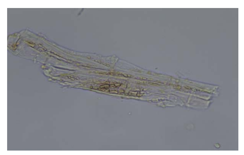
Fig. 3: Powder microscopy of P. hadiensis (glycerol) (40x)