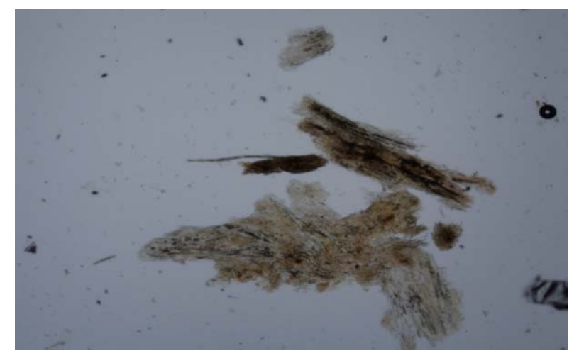
Fig. 2: Powder microscopy of P. hadiensis (glycerol) (4x)