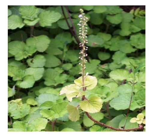
Fig. 1: Plectranthus hadiensis

sclerenchymatous fibers from the vascular bundle region, thin, and isolated fibers measure 200 - 600 microns in length and 10 - 20 microns in breadth. Fragments of mesophyll tissue containing vascular strands are seen good many in number. The anatomic characteristics are visualized using the glycerol staining and phloroglucinol stains the lignin content of the powder specimens (Figure 2-5). The xylem vessels are clearly visible using glycerol at 40x magnification (Figure 6).