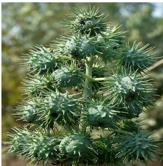
Fig. 1: Fruit