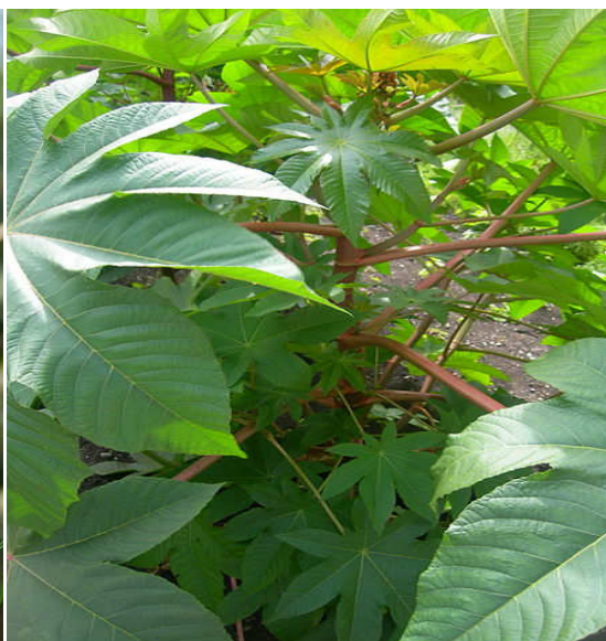
Fig. 2: Whole Plant