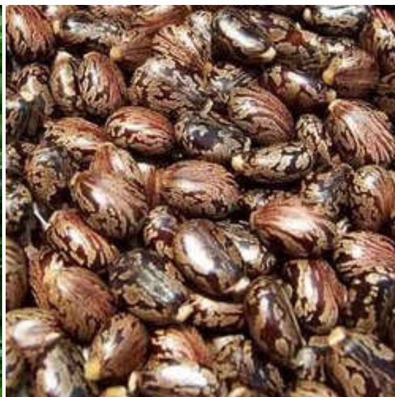
Fig. 4: Seed