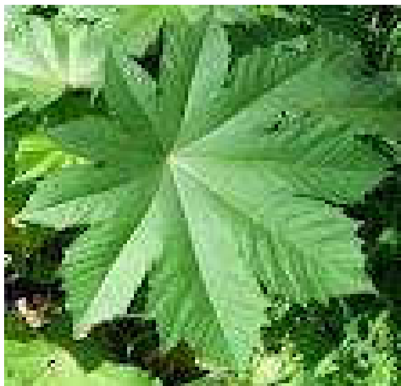
Fig. 3: Leaf