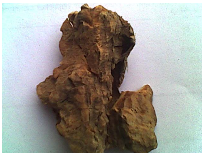
Dried Bark of Plumeria acutifolia (Poir)

The foaming index, swelling index and pH of the extract are tabulated in Table 7.