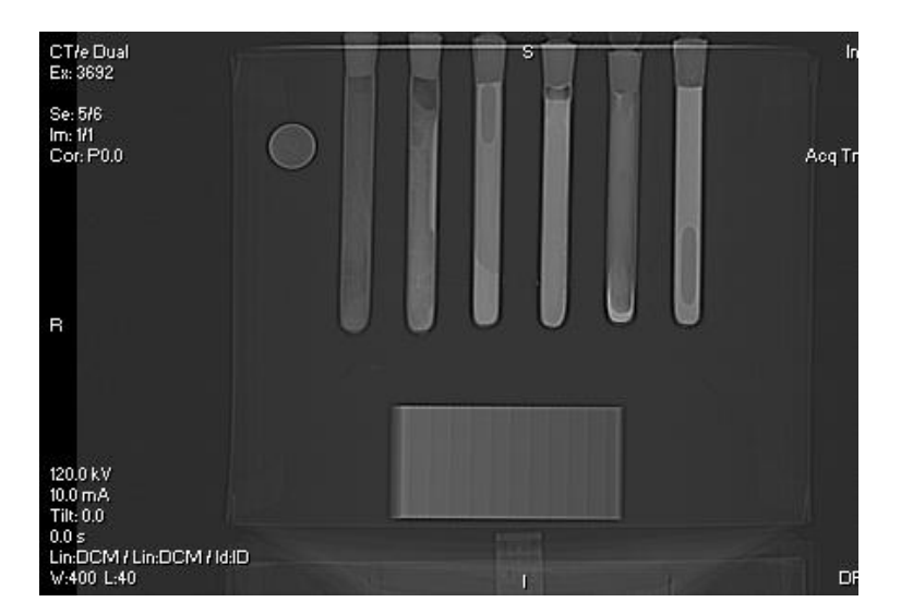
Fig. 2: X-ray images of samples of contrast mediums in vitro (from left to right):

Digital processing of X-ray images of contrast agents (Fig. 2) makes it possible to compare an optical density of X-ray photograph of test tubes with contrast mediums and to define a quantity define a value of radiodensity of the studied substances (in Hounsfield units (HU)). (table 2)