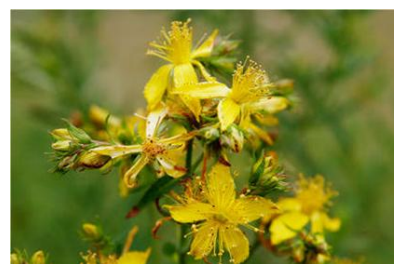
Active principles in St. John's Wort

The name of plant derives from its flowering around the time of St. John's Day, June 24. In recent years St. John's wort has been studied extensively as a treatment for depression. Most studies show that St. John's wort may help treat mild-to-moderate depression, and has fewer side effects than most other prescription antidepressants. But it interacts with a number of medications, so it should be taken only under the guidance of a health care provider.