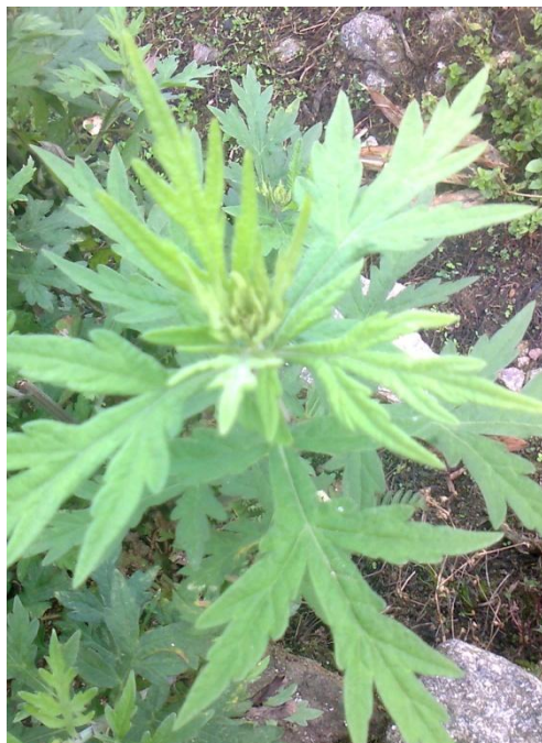
Fig. 1: Artemisia indica herb.

The plant Artemisia indica was collected from Darjeeling, West Bengal, India in the month of April 2012 (Figure 1). The whole plant material was washed in running tap water and then shade dried. After complete drying the dried plant material was porously powdered mechanically and was subjected to cold extraction.