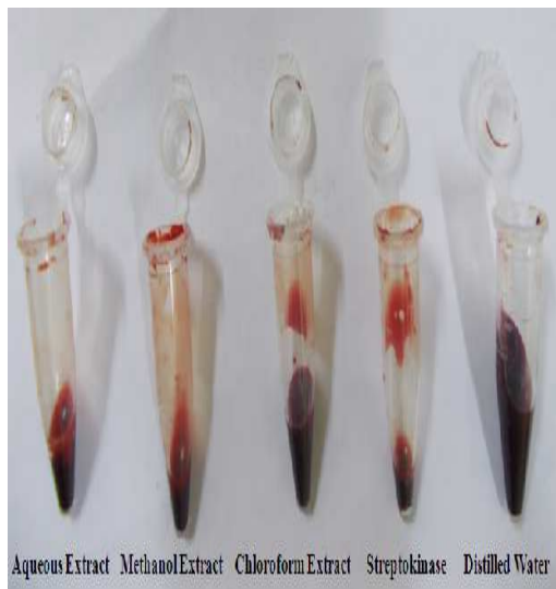
Fig. 1: Dissolved clots after treating with different extracts of T. angustifolia

Values are expressed as Mean \pm SEM, Sample volume 3(n=3), p <0.05.