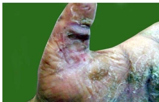
Fig. 1: Moderate lichenification, hyperkeratosis & Fissures with marked erythematous lesions of the palms.

materials with which she was in daily contact (polymer, monomer, acrylic resin, latex gloves, vinyl gloves and separating medium - Photo 4) and intradermal test for atopic reaction was carried out. The dermatologist prescribed Prednisolone 30mg (Omnacortil) for 6 days in a tapering dose for the symptomatic relief to the patient.