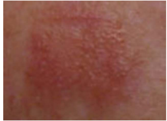
Fig. 4: Positive reaction to methyl methacrylate (Monomer) solution.