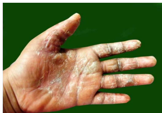
Fig. 2: Persisted symptoms after Antihistamine & Antibiotic therapy.