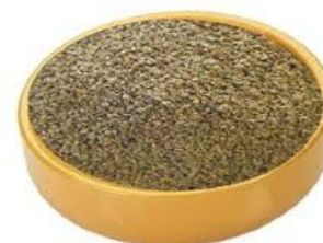
Fig.1: Trachyspermum ammi L.

Plant material was collected from local market and authenticated at KWC-Arts, Commerce, Science, Department of Botany, Sangli.