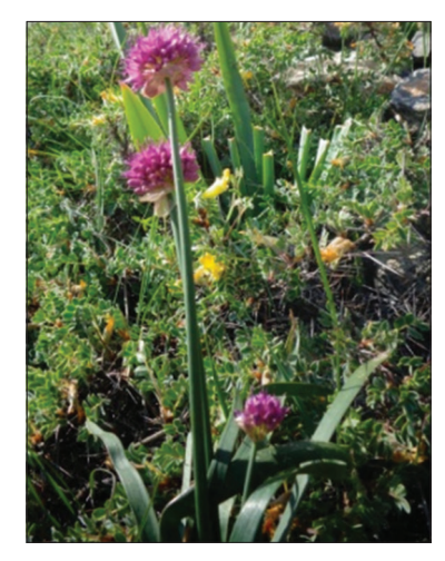
Fig. 1: The wild plant Allium carolinianum growing in its natural habitat