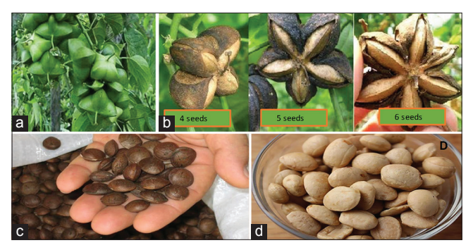
Fig. 1: (a) Sacha inchi green fruit (b) Sacha inchi seed mature (c) Sacha inchi seed mature with peel (d) Sacha inchi without peel.

GC/MSD: Gas chromatography/mass selective detector, FAMEs: Fatty acids methyl esters