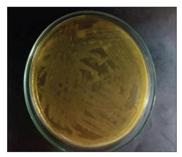
Fig. 1. Shigella dysenteriae colonies on an agar medium Shigella-Salmonella

Furthermore, biochemical test conducted on the basis of metabolism caused by enzyme working power [19]. The results of biochemical tests can be seen in Table 3.