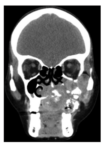
Fig. 3: Coronal contrast-enhanced computed tomography scan showing heterogeneously enhancing mass with destruction of bone in the hard palate and left maxilla

which showed the presence of recurrence of the tumor. The tumor was excised with bilateral external carotid artery control. The patient reviewed 3 months with another recurrence but refused treatment and was lost to follow-up.