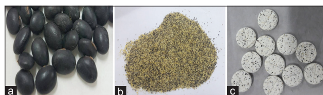
Fig. 1: (a) Soybean ( Glycine max L. Merr) Detam II varieties seed, (b) soybean ( G. max L. Merr) Detam II varieties powder, (c) soybean ( G. max L. Merr) Detam II varieties tablet

Particle size distribution showed that all of the formulas had the amount of fines below the requirements of 10–20% [13], but they have a normal size distribution with the major fraction is in the 300–600 \mu\text{m} shown in Figure 2. particle size. The example of the particle size distribution curve was shown in Fig. 2 for Formula 1 until 3.