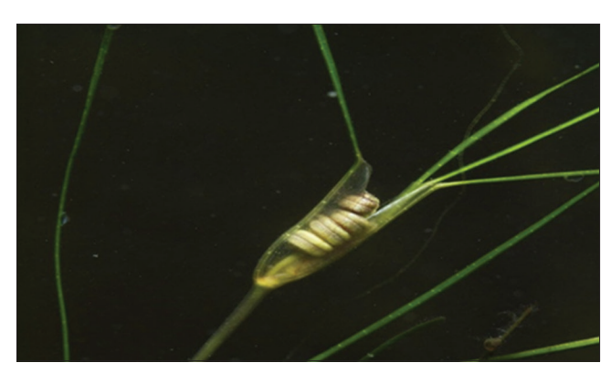
Fig. 1: The seeds of seagrass