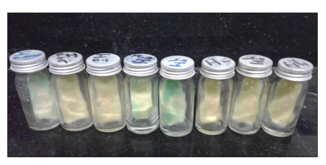
Fig. 2: Drug susceptibility testing performed in Lowenstein Jensen medium using absolute concentration method