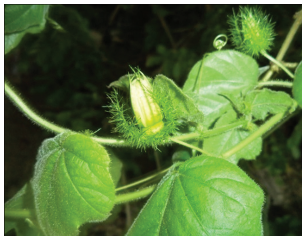
Fig. 1: Habit of Passiflora foetida

The meticulous analysis of cytotoxic and apoptotic action of P. foetida (Fig. 1) over HeLa cell line had shown dose-dependent effect in a highly significant manner. The cytotoxic effect was confirmed by percentage of cell inhibition with respect to MTT assay, and the concentration of the methanol extract required to inhibit 50% viability of the cells was determined as IC_{50} value and calculated to be 21.55 µg/ml (Table 1) which revealed the significant toxicity compared to the other medicinal and nonmedicinal plants reported against cervical cancer cells [31,32]. The viable cells with active metabolism converted MTT into a purple colored formazan product which served as a visual marker of the viable cells, and the absorbance measured at 570nm was used to find the IC_{50} of extract over the HeLa cells. The IC_{50} value obtained in this study had proved that P. foetida possess an effective cytotoxic effect. As the crude extract possessing an IC_{50} < 20 µg/ml are considered to have active compounds against the cancer cells according to the criteria of Standard National Cancer Institute [33,34], the IC_{50} value of this study was found to