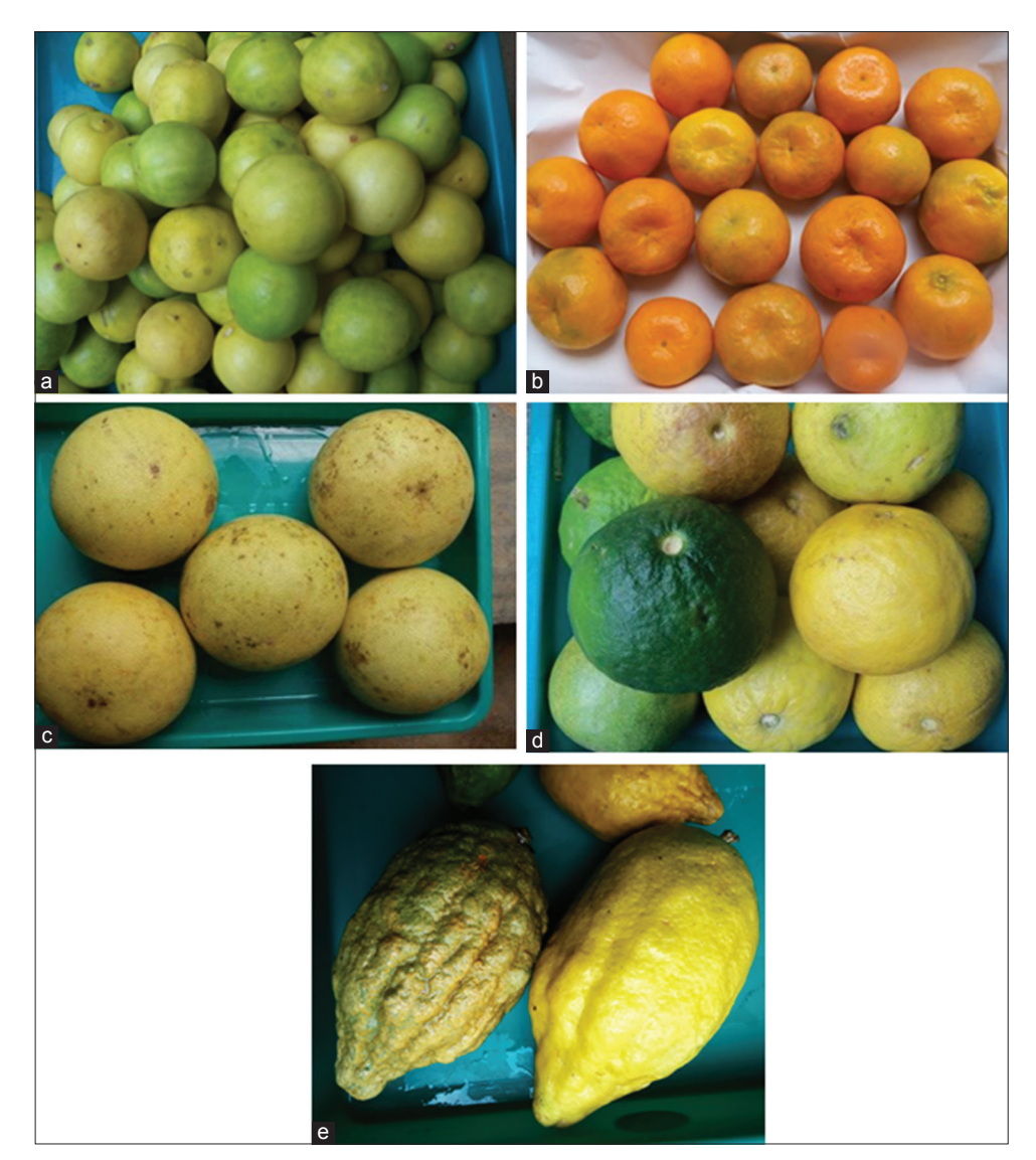
Fig. 1: Citrus fruits. (a) Citrus aurantifolia. (b) Citrus reticulate. (c) Citrus grandis. (d) Citrus aurantium and (e) Citrus medica

Ascorbic acid content of peel and pulp extracts of Citrus was determined by 2,4-dinitrophenylhydrazine method as described by Sadasivam and