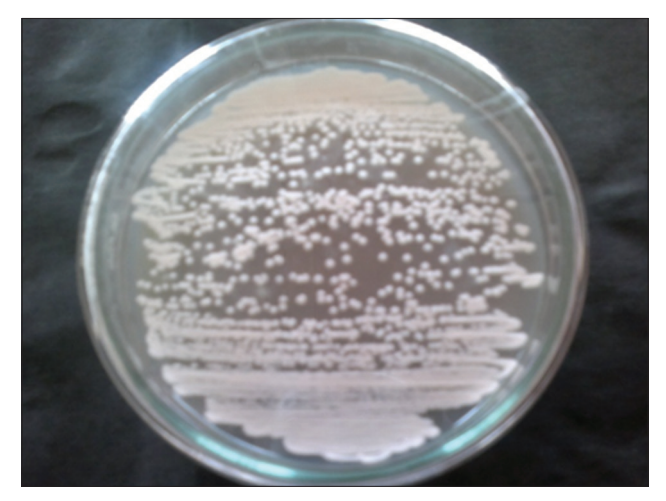
Fig. 1: Colonies after 1-week inoculation of Streptomyces sp. on Starch casein agar