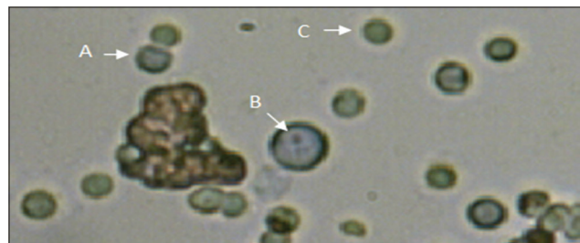
Fig. 1: Bone marrow cells: (a) Polychromatic erythrocytes (PCE), (b) larger cells containing micronucleus PCE, and (c) normochromatic erythrocytes

Fig. 3 shows the ratio of PCE/PCE+NCE between normal controls and giving BHEE 300 mg/kg equal. Compared to the ratio of PCE/PCE+NCE negative control with BHEE administration, there was an increase in the ratio with increasing doses of BHEE, although in the BHEE dose of 200 mg/kg there was a slight decrease in the ratio but not below the negative control ratio. Increase in PCE/PCE+NCE ratio indicates that BHEE administration reduces MN formation and cell proliferation