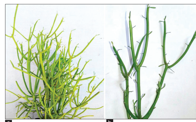
ang. 1: (a) Sarcostemma acidum Wight. and Arn. (b) Closer view of the plant bearing opposite scale leaves

Due to the diverse presence of the plant in Euro-Asian region and warmer part of India, unique medicinal properties, and uses by the Ethnic Communities in India [14], it becomes necessary to assess pharmacognostic details of the plant for evaluation and formulation of a suitable dosage of bioactive compounds for the preparation of effective drugs and their application in treating various diseases and sharing information with the rest of the world. Moreover, the documentation of indigenous knowledge on the use of plants helps in gathering information about the geographical distribution of the plant and to forward suggestions for its sustainable use and conservation and to preserve the unrecorded information [22] which may either be lost forever. Therefore, there is an urgent need to record this precious ethnomedicinal knowledge about the plant so that in future it could aid in drug discovery and development of affordable health care for poor and rural people. Keeping the aforesaid facts in view,