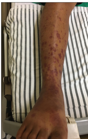
Fig. 1: The right leg showing palpable erythematous purpuras

As the most common systemic vasculitis affecting children, HSP has the annual incidence of 3–26/100,000, most frequently found in children from 4 to 7 years old. In adults, the incidence of HSP is relatively rare with the annual incidence ranging from 0.1 to 1.8/100,000 individuals [5]. The self-limiting nature of HSP might also mask the true incidence rate [3]. The overall incidence of adult-onset HSP in Indonesia to this date is still unclear, most probably due to the lack of reports or underdiagnosis.