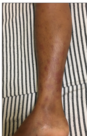
Fig. 4: Regressed palpable purpura