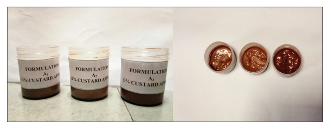
Fig. 2: Formulated anti-aging cream containing custard apple leaf extract