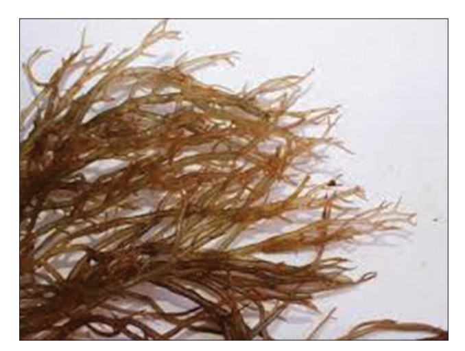
Fig. 1: Gracilaria edulis

The anticancer activity was done and tested against the MDA-MB 231 by MTT assay [19]. The anticancer activity against cancer cell line was inhibited with increased concentration of solvent crude extract. In MDA-MB 231 more cytotoxic effect was observed in methanol extract in 24 h treatment. It showed that the increased concentration of drug present good toxicity over cancer cell line. It had a maximum of 94.06% cell viability for 20 \mu g of crude methanolic extract. Similarly, the drug showed its minimum of 37.75% cell viability of methanol extract. It represents that the increased concentration of drug present good toxicity over MDA-MB 231 [14,16,20] (showed in Table 5).