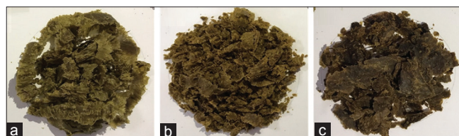
Fig. 2: The representative picture shows the blended avocado samples dried at different temperatures such as 60 (a), 80 (b), and 100°C (c)