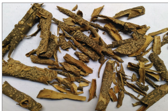
Fig. 2: Zanthoxylum armatum DC. Stem Bark