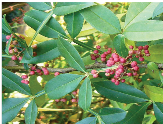
Fig. 1: Zanthoxylum armatum DC.

The physicochemical characteristics of stem bark powder; namely foreign matter, loss on drying, and ash values were given in Table 3. The result showed that the selected plant sample contained minimum amount of foreign matter (0.82%) and moderate amount of moisture content (6.134%). The total ash value was found to be 9.60% and water soluble ash content 3.12% was more than the acid insoluble ash 2.58%. The chloroform (9.67±0.58) and ethyl acetate (8.63±0.76)