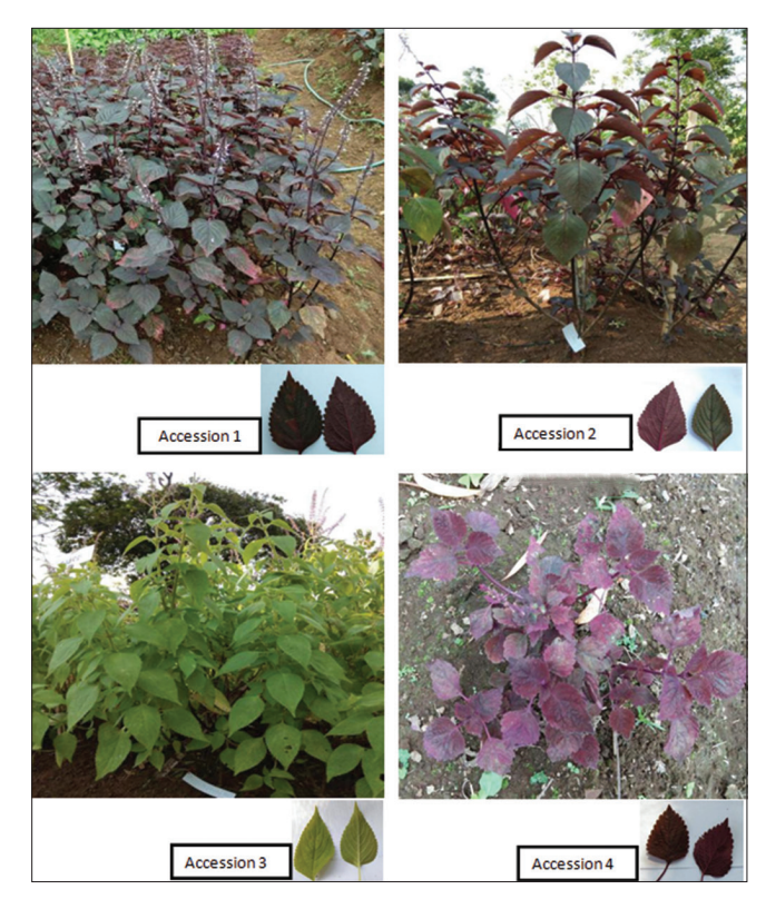
Fig. 1: The accession of four plants that are grown in lowland Karanganyar

Total extract content did not give a significantly difference in the accession of the iler plant. Accession 3 shows the highest extract level 6.892% ( \pm 0.25 ), whereas accession 2 showed the lowest extract yield with 5.677% ( \pm 1.51 ).