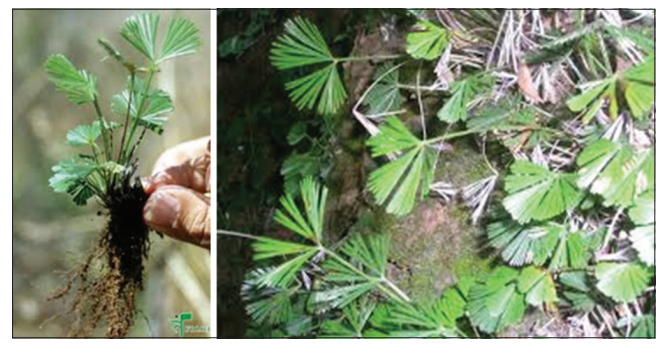
Fig. 3: Actiniopteris radiata (Sw.) Link (Mayurashikha)