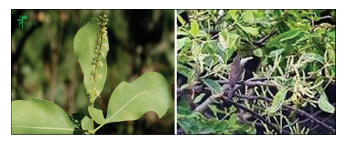
Fig. 4: Terminalia pallida Brandis (Tella karaka) (Endemic plant)