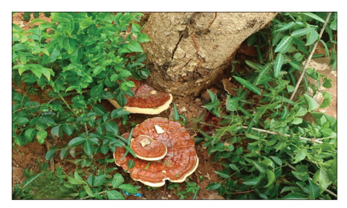
Fig. 1: Ganoderma lucidum (Test mushroom)

The antibacterial assay of the test samples was performed in microtiter plate using resazurin as an indicator of cell growth adopting the procedure of Sarker et al. [27]. The organisms were diluted to 200 times by 1% MHA. A sterile 96 well plate was labeled as per the protocol designed. A volume of 100 \mu l of test protein was pipetted out into the appropriate columns of the plate. Following this, the microwells of the respective rows were filled with 10 \mu l of the diluted bacterial suspension (5×10<sup>6</sup> CFU/ml). Finally, to each well, a 10 \mu l of resazurin