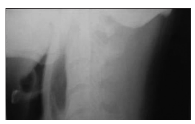
Fig. 1: X-ray neck lateral view showing air column in pre-vertebral space pushing the posterior pharyngeal wall anteriorly

An magnetic resonance imaging (MRI) was taken which revealed collection of air in the retropharyngeal and retrocardiac area until T10