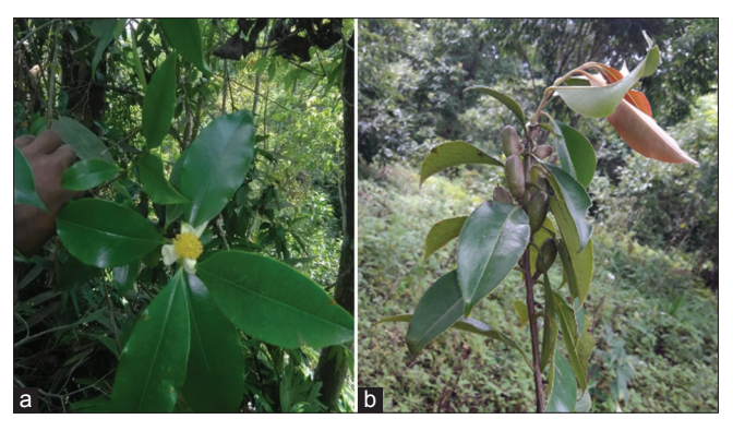
Fig. 1: (a) Flower and leaves, (b) fruit and leaves of Gordonia dipterosperma Kurz. (Theaceae)

A fine transverse section of the fresh leaves shows the anatomy of the leaves such as lower epidermis, sclerenchyma, phloem, xylem, collenchyma, palisade, and the upper epidermis, as shown in Fig. 3.