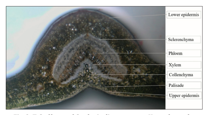
Fig. 3: T. S of leave of Gordonia dipterosperma Kurz. shows the anatomy of the leaves