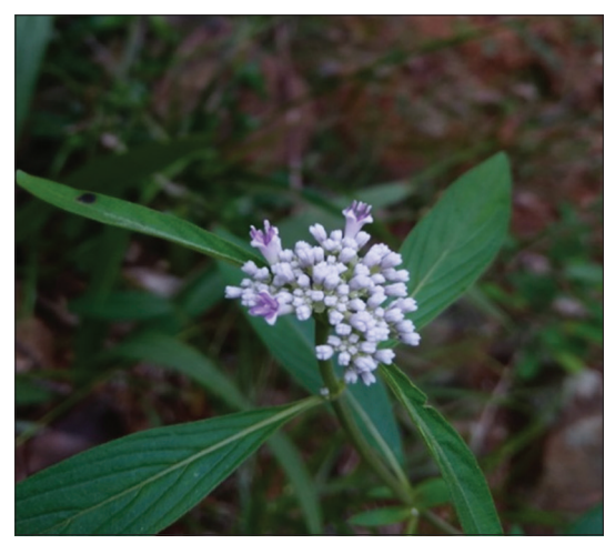
Fig. 1: Knoxia sumatrensis (Retz.) DC

at a constant flow of 1 mL/min. The temperature of injector was set 260°C in the chromatographic run. Sample 1 \mu L was injected in to the instrument at the oven temperature 60°C (2 min); after that 300°C at the rate of 10°C min<sup>-1</sup> and 300°C were its hold for 6 min. The mass detector temperature 240°C, ion source temperature 240°C, ionization mode electron impact 70 eV, a scan time 0.2 s, and scan interval 0.1 s. The characterizations of compounds were compared with the database