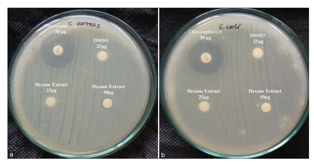
Fig. 3: Antibacterial activity of K. sumatrensis hexane leaf extracts against (a) S. aureus and (b) E. coli