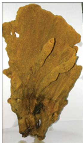
Fig. 1: Natuna sea sponge