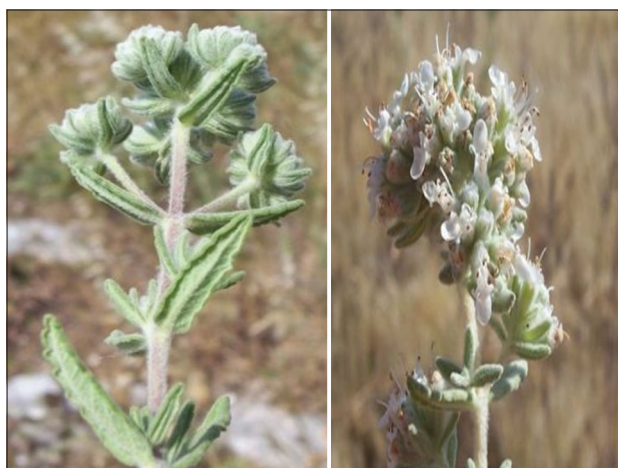
Fig. 1: Teucrium polium leaves and flowers

C. From the aerial parts were identified by gaschromatographic and spectroscopic techniques (1H-NMR and MS) stigmasterol, beta-sitosterol, brassicasterol, clerosterol and campesterol [32].