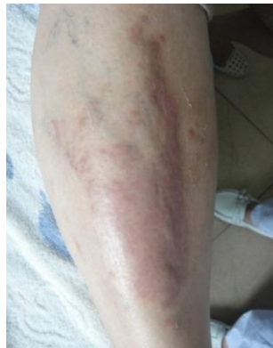
b) After 1 st Week treatment