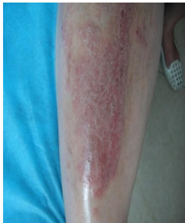
a) Before Treatment