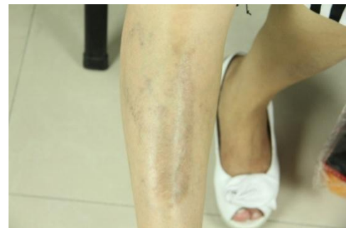
c) After 6 th Week