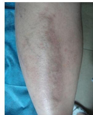
b) After 3rd Week