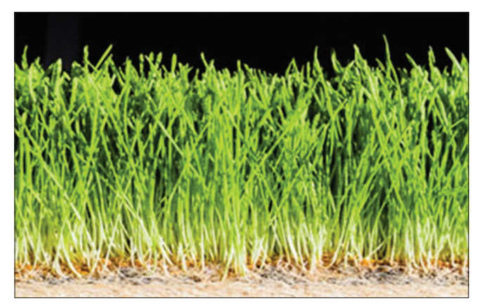
Fig. 1: Wheatgrass (Triticum aestivum Linn.)