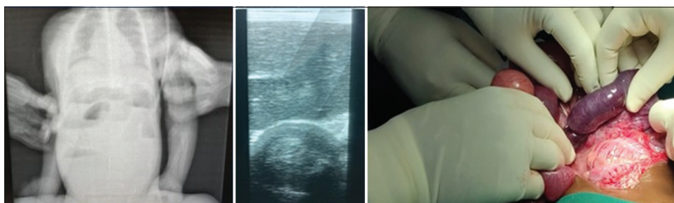
Fig. 3: X-ray, ultrasound, and intraoperative findings of case 3