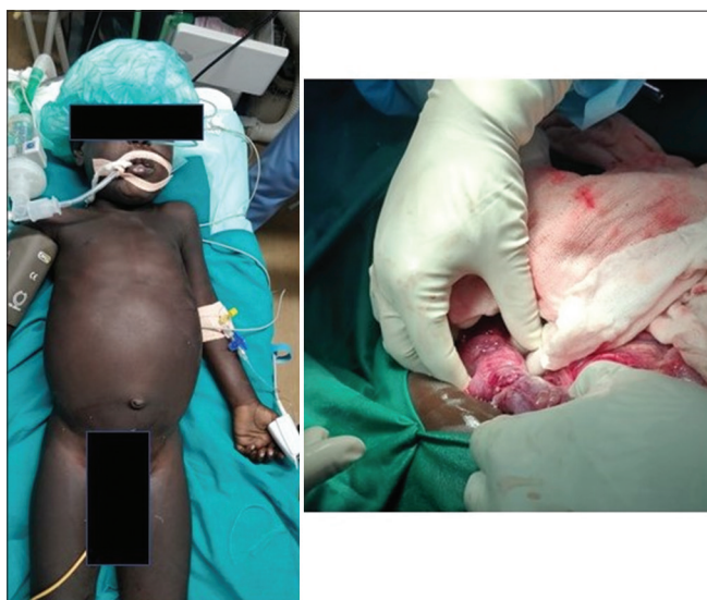
Fig. 3: Pre-operatively showing distended abdomen and Intra-operatively showing ileo-ileocolic intussusception with no perforation of case 3