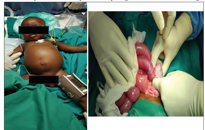
Fig. 1: Pre-operatively showing distended abdomen and Intra-operatively showing distended abdomen and a large segment of terminal ileum into the Cecum and ascending colon into the transverse colon of case 1

Intussusception is seldomly found in young children between the age