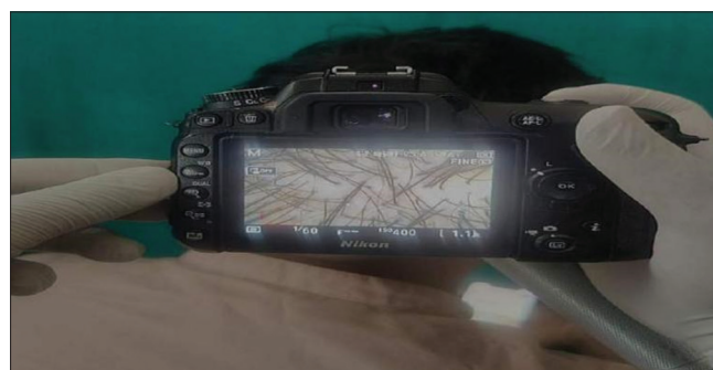
Fig. 2: Dermoscopy procedure