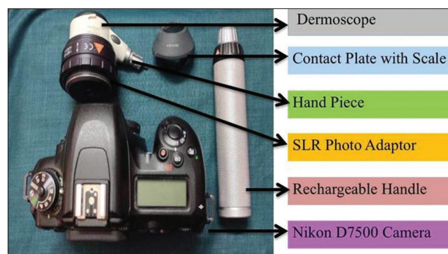
Fig. 1: Heine Delta 20T digital dermatoscope with DSLR camera (NIKON-D7500)

Table 2 shows that the number of hair follicular units per dermoscopic field of 20 \text{ mm}^2 ( 4 \text{ mm} \times 5 \text{ mm} ) shows negative correlation with increasing age and has significant p < 0.05 in frontal, occipital, and vertex area while not significant in temporal area. The number of single hair follicular units per dermoscopic field of 20 \text{ mm}^2 ( 4 \text{ mm} \times 5 \text{ mm} ) shows positive correlation with increasing age and has significant p < 0.05