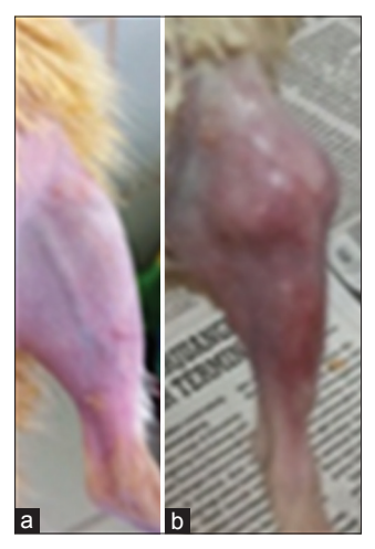
Fig. 1: The effects of monosodium iodoacetate on knee joint of the rat. (a) untreated rat, (b) treated rat