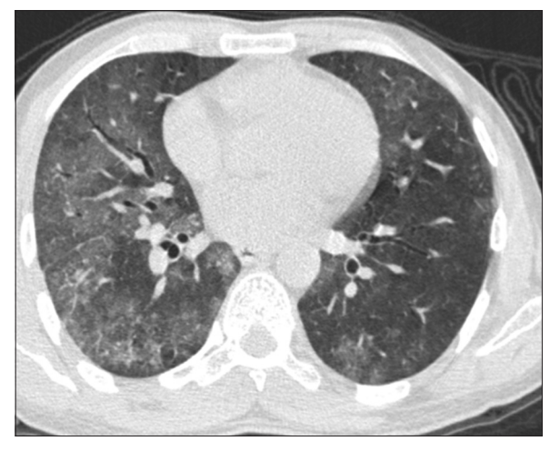
Fig. 3: Computed tomography chest showing acute interstitial pneumonia

Bleomycin, a G2 and M phase cell cycle specific agent, with a molecular weight of 1500 has two binding regions, one for iron and other for DNA. Cytotoxic activity of bleomycin is mainly because of iron being an essential cofactor. Free radical that causes breaks in DNA single and double strands are formed when bleomycin binds to iron and oxidizes iron molecule finally culminating in cell death. It is said to cause oxidative degradation of cellular RNA as well. It has a half-life of 3hrs, and enzyme bleomycin hydrolase rapidly inactivates it in the liver and kidneys. Since 60-70% of drug is eliminated via kidneys careful monitoring and dose reduction is required in case of renal dysfunction. Side effects profile