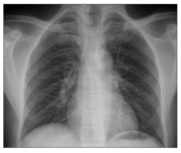
Fig. 2: Normal chest X-ray before chemotherapy

chemotherapeutic agents, due to inadequate removal toxic metabolites, disturbance in oxidant/antioxidant hemostasis, due to immune medicated antigen - antibody complex deposition and finally due to aggregation of amphiphilic compounds in alveolar macrophages [4].