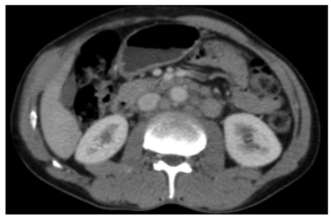
Fig. 1: Computed tomography scan abdomen with enlarged lymph nodes in para-aortic, aortocaval, periportal, and peripancreatic region