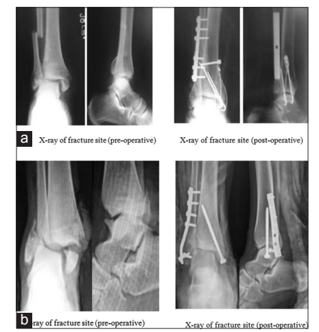
Fig. 4: (a) Patient 1 - X-ray of the fracture site compared pre and post operatively. (b) Patient 2 - X-ray of the fracture site compared pre and post operatively in the same patient