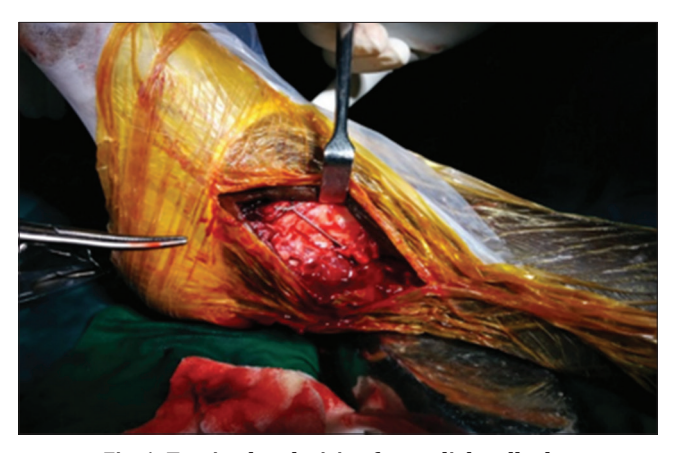
Fig. 1: Tension band wiring for medial malleolus

Of 30 patients, fractures of the lateral malleolar were fixed with onethird tubular plate in 21 (70%) patients. K-wires (n=07, 23.3%) and cancellous screws (n=02, 6.6%) were also used in fixing the fracture.