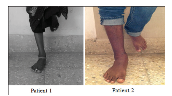
Fig. 8: Restoration of standing on one leg during follow-up