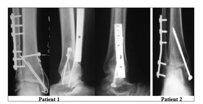
Fig. 5: Complete union at 6 months

show the restoration of movement at the ankle joint to the pre-injury level.