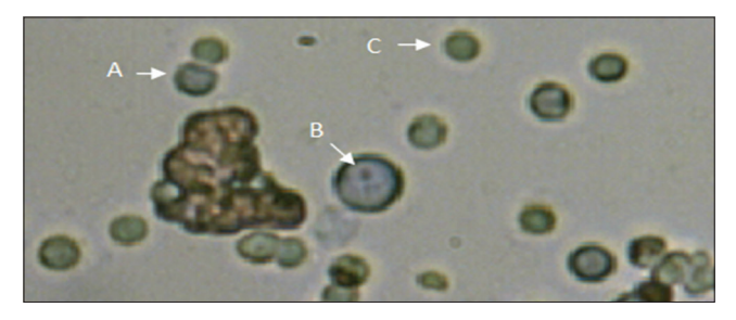
Fig. 1: Bone marrow cells: (a) Polychromatic erythrocytes (PCE), (b) larger cells containing micronucleus PCE, and (c) normochromatic erythrocytes

Fig. 3 shows the ratio of PCE/PCE+NCE between normal controls and giving BHEE 300 mg/kg equal. Compared to the ratio of PCE/PCE+NCE negative control with BHEE administration, there was an increase in the ratio with increasing doses of BHEE, although in the BHEE dose of 200 mg/kg there was a slight decrease in the ratio but not below the negative control ratio. Increase in PCE/PCE+NCE ratio indicates that BHEE administration reduces MN formation and cell proliferation