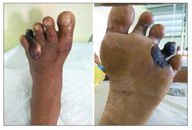
Fig. 1: Clinical picture when the patient comes to hospital

After that we performed PTA to open the blocked in left tibial artery. We observe the rest pain and revascularization after PTA (Fig. 4). The condition was better, decreasing rest pain, and distal pulsation of artery was palpable. However, the gangrenous fourth toe was irreversible, at the end, his fourth toe was amputated at next 6 months. After 1-year follow-up, there was no expansion of the gangrene to other toes, complete wound healing, and good pulsation of distal vessels.