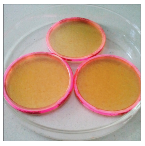
Fig. 1: Ranitidine HCl buccal films

In vitro drug release studies were performed for all the prepared formulation using phosphate buffer (pH 6.8) as dissolution medium and measuring drug concentration UV spectrophotometrically at 313 nm. The studies were performed for 12 hrs. The results of in vitro studies are shown in the Table. 2. Distinguishable difference was observed in the release of Ranitidine HCl containing SFG and carbopol 934P in comparison with plain SFG and plain carbopol 934P films. The graph was plotted by taking Cumulative percentage release Vs Time and the graphs are shown in the Figs. 2 and 3. The cumulative percentage drug release was observed in the formulation A3 after 12 hrs was found to