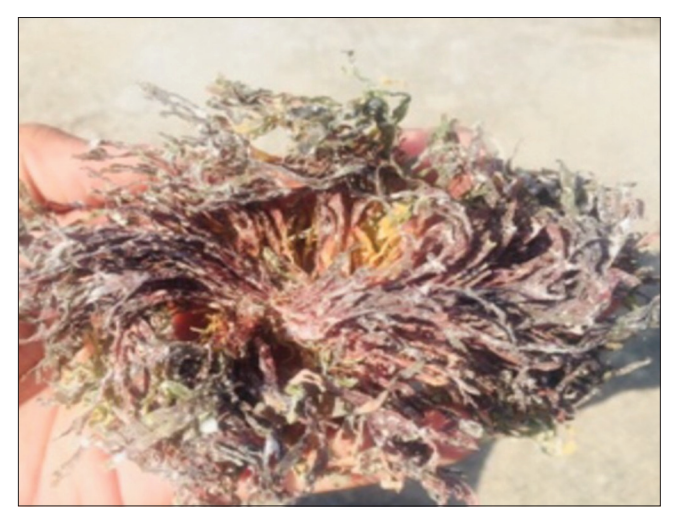
Fig. 1: Gracilaria corticata

The extracts were tested on McCoy cell. The cancer cell line was collected and grown in Dulbecco's modified eagle modified eagle medium (DMEM) with fetal bovine serum. Cells were seeded in 96-well and allowed to adhere for 24 h at 37^{\circ} C, with CO_{2^{\prime}} in an incubator. Then, one of it serially diluted samples in medium was dispensed into the wells of the cell plates and incubated for a further 72 h. After removal of the sample medium, the cells were added with DMEM medium and incubated. After 72 h, cells were fixed with cold 40% trichloroacetic acid at 4°C for 1 h and washed with water. The absorbance was measured,